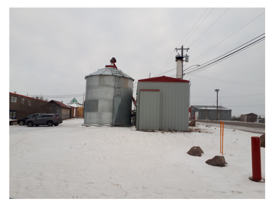
Figure 4. A wood pellet heating facility in Behchoko, N.W.T. November 12, 2019

The standing senate committee in its report explains that wind and solar are more expensive than diesel generation, and territories do not have the ideal climate for both solar and wind. Wood pellets are another source that has recently come into use in the Territories. Heat generation through wood pellets can be more expensive than diesel; however, the biomass heating can save up to 30-50 percent in saving when compared to oil furnaces. In 2014, around 14 communities in N.W.T. received wood pellet heating.